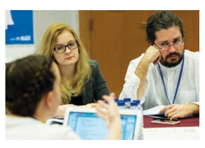
• Intense discussion during Session 3 of the meeting: digging deeper on identifying challenges and opportunities to strengthen GCED implementation for Europe and North America.