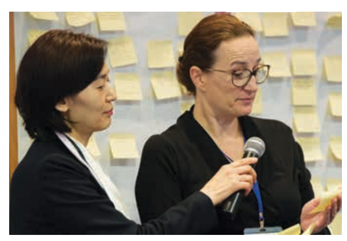
Learning from each other's experiences, the meeting discussions went forward to develop recommendations and strategies towards forming a regional network.